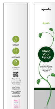
Visualization of a custom design example.