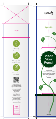
Please remember to deactivate layer with dieline